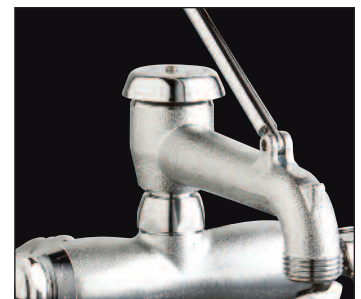
Service sink faucet with atmospheric vacuum breaker spout, model 445-VBRRCF

The spout incorporates a vacuum breaker that is closed by the ambient air pressure when the water flow is off. It helps prevent back-siphonage from a non-pressurized source – like a hose submerged in a bucket of contaminated water.