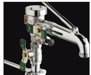
Service sink faucet with continuous pressure vacuum breaker spout, model 445-PVBCP

The spout incorporates a vacuum breaker that contains a spring-loaded poppet that helps prevent contaminated water from entering the water supply. The vacuum breaker must be installed vertically. Pressure must not exceed 150 psi.